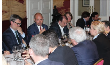
"New Dynamics in the Middle East" hosting Gideon Saar, former Israeli Interior Minister

our strategic outlook for 2017 in the field of countering terrorism and to solidify where we aim to achieve higher visibility as an organization of expertise in Brussels.